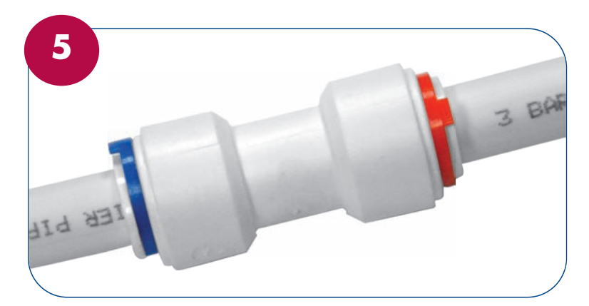
To identify hot and cold water circuits use red/blue collets (supplied separately).

Check that the assembly is secure by pulling away the pipe from the fitting.