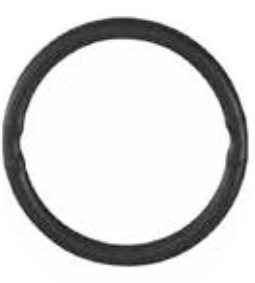
Patented >B< Press O-ring

>B< Press benefits from patented 'leak before press' O-ring technology (12 to 54 mm) which indicates if a joint has not been pressed. The O-ring contains two in-built water pathways that allows water to pass through and create a noticeable leak when the system is tested at low pressure (0.1 to 6.0 bar).