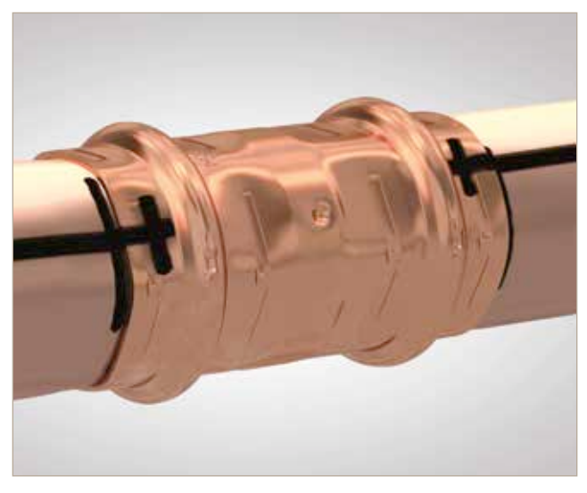
>B< Press pressed joint profile

Please refer to the technical brochure or www.conexbanninger.com for the approved list of press machines and jaws.