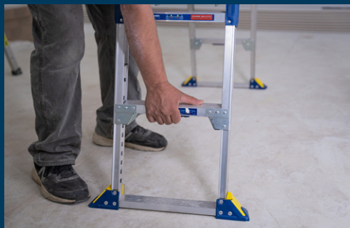
Single handed lock and height adjustment for ease of use