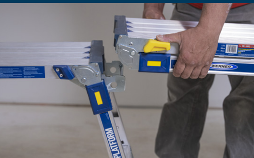
Quick link technology links 2 or more platforms*