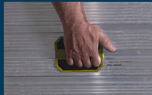
Easy-Grab handle for easy transporting and manoeuvring