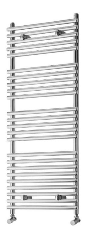
10 Year Guarantee

Please note: Radiator shown for illustration purposes only.