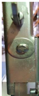
Fixing as viewed from front/rear of trailer