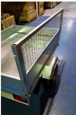
Side panel viewed from right hand side

1. Commence assembly by locating the side panels onto trailer as shown.