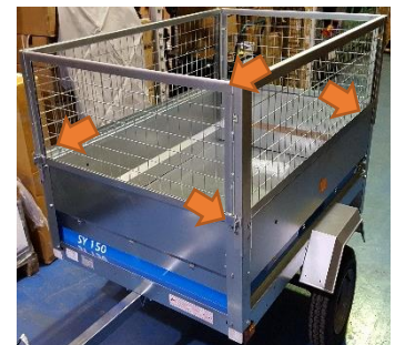
Antiluce x 4 (one per corner)

Note: Never use the trailer with the mesh kit partially fitted or assembled. Ensure all fixings are secure prior to first use and regularly inspected thereafter.