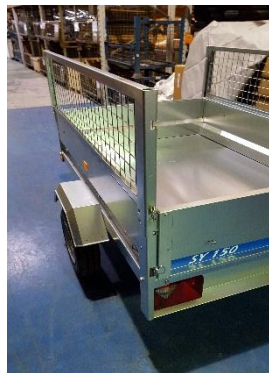
Side panel viewed from left hand side

2. The side panels are secured at two fixing points in each corner, as circled.