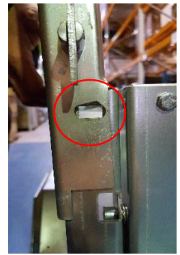
Location of fixing as viewed from front/rear of trailer

3. Secure the side panels at the eight fixing points using the M6 screws and nyloc nuts provided. Ensure an oversize washer is used both internally and externally at each fixing point. In some instances the placement of additional oversize washers may be required in between the trailer and mesh kit to accommodate manufacturing tolerances. It is important that gaps are filled with washers to allow fixings to be fully tightened without distorting the trailer or mesh kit.