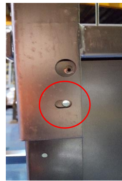
Location of fixing as viewed from side of trailer

2. The side panels are secured at two fixing points in each corner, as circled.