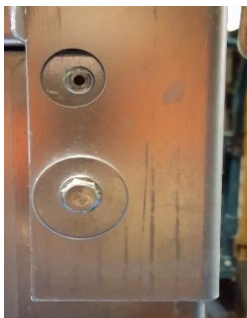
Fixing as viewed from side of trailer

3. Secure the side panels at the eight fixing points using the M6 screws and nyloc nuts provided. Ensure an oversize washer is used both internally and externally at each fixing point. In some instances the placement of additional oversize washers may be required in between the trailer and mesh kit to accommodate manufacturing tolerances. It is important that gaps are filled with washers to allow fixings to be fully tightened without distorting the trailer or mesh kit.