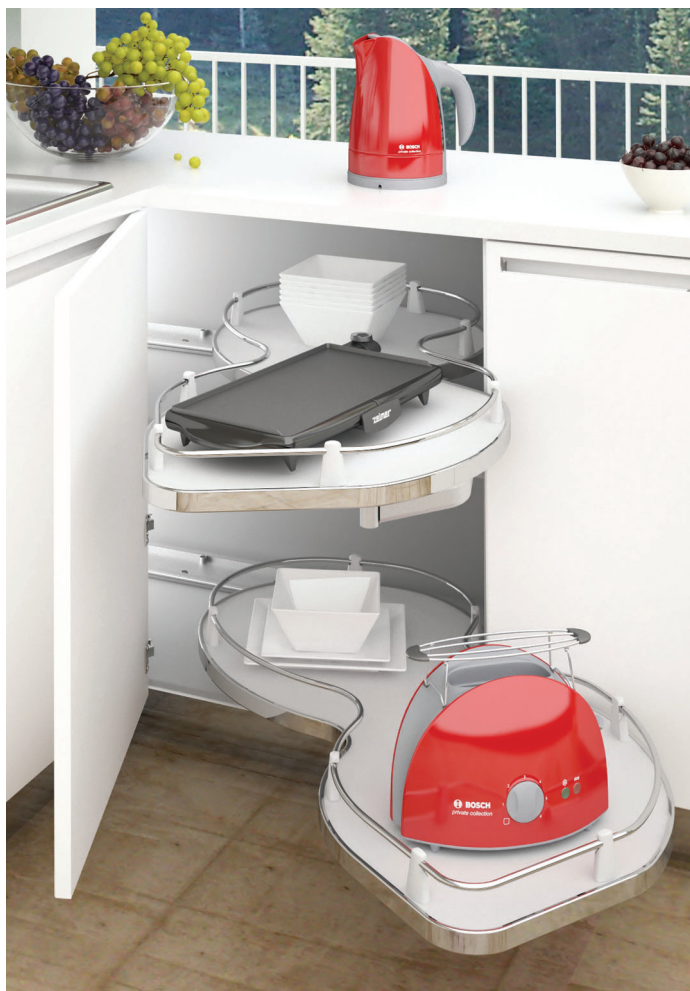
Nuvola corner pull out shelving unit, white base with polished chrome rail

Ideal for retrofitting. Shelves operate independently of each other. Available with white shelves.