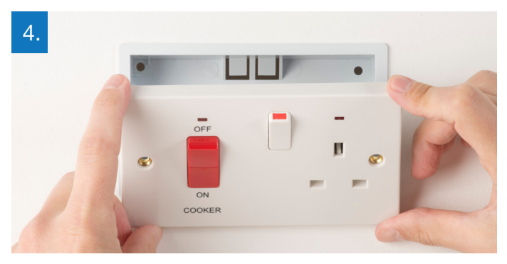
Gently ease the socket from the mounting box to show the wiring.

At the consumer unit, find the trip switch which protects the circuit and turn it all the way off. The indicator window should stay green.