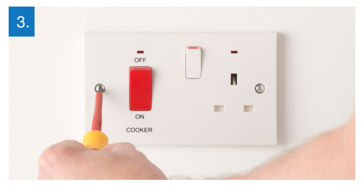
Test power is not supplied to the socket by using a plug in socket tester or multimeter. Unscrew the retaining screws on the socket so that it is released from the mounting box.

To start, make sure you are familiar with the safety warnings in this leaflet, the instructions supplied with the product and the mains supply is turned off.