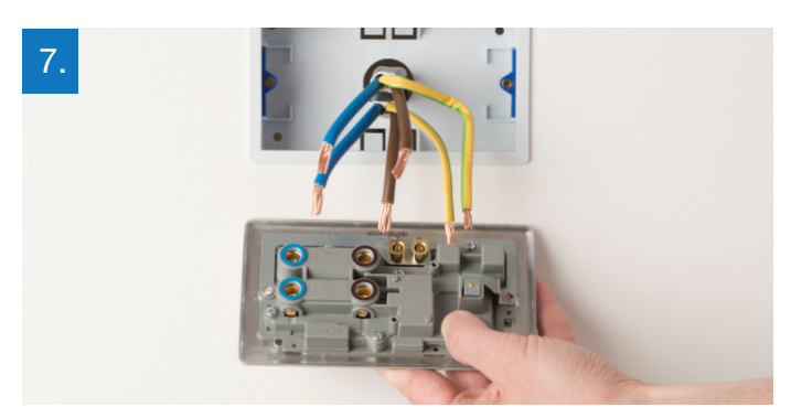
Line up the new socket and take note of where each terminal is located.

For this outlet there will be two sets of wires; one set for the supply (incoming power) and one for load (cooker).