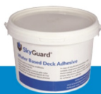
Water Based Deck Adhesive