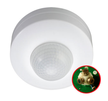
3 × DETECTOR