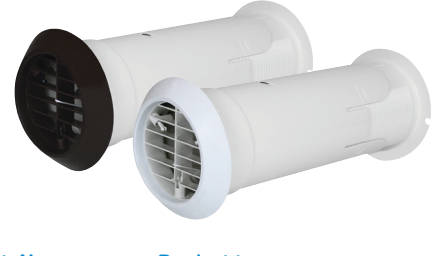
Cat. No. DHRIWKW DHRIWKB DHRIWKBS

A Step-by-Step Guide to installing the Manrose Deluxe Quick Internal Fit Wall Kit.