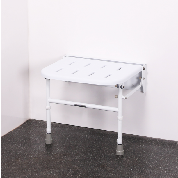
Premium wall mounted shower seat with legs