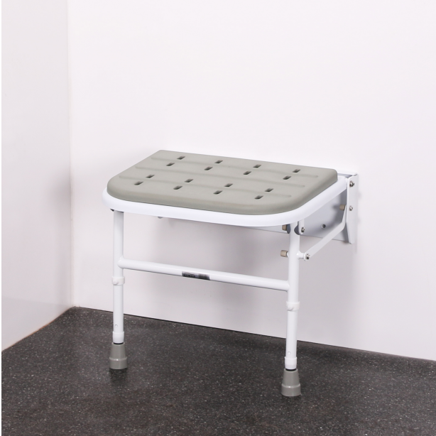
Premium wall mounted shower seat with legs & pad