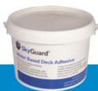
Water Based Deck Adhesive