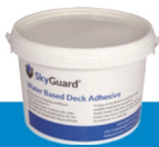
Water Based Deck Adhesive