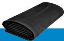
Long Life EPDM Membrane

Once you're all measured up, simply find the best size from our range of Standard Shed Roof Kits. IF IN DOUBT GET THE NEXT SIZE UP! Optional edge trims are available, just be sure to make a note of which edge the water runs off. Custom Kits are also available should you not be able to find a standard kit that meets your requirements.