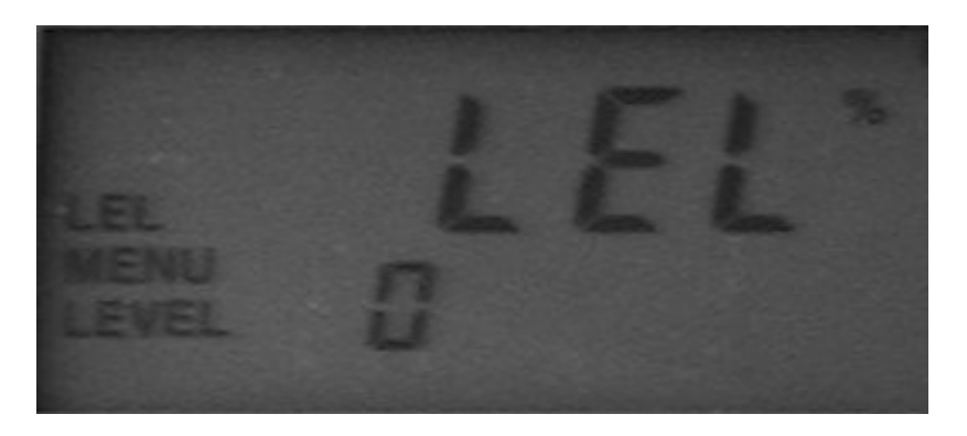
"LEL %" will display leak levels in %LEL (Lower Explosive Limit)