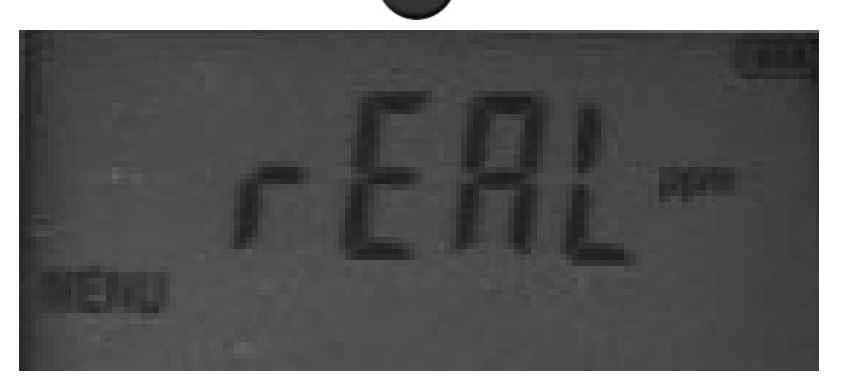
"REAL" mode will display leak levels in ppm (parts per million)

6. Depending on the last display mode selected one of the following displays will be seen. The display modes can be changed by using the key to cycle between them.