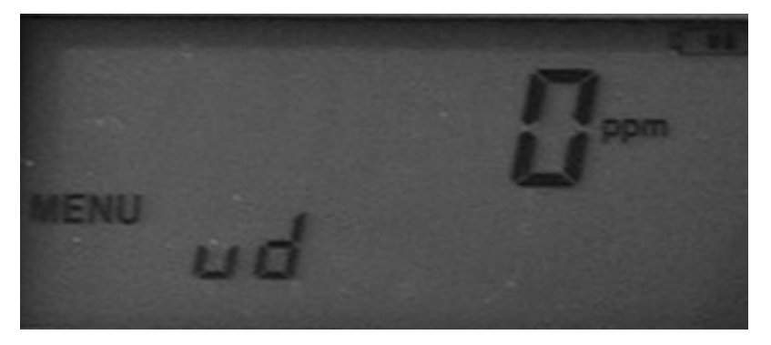
"Oppm ud (ud=under)" will display leaks in steps. The steps are Oppm, ud 500ppm, ud 1000ppm, ud 3000ppm, ud 5000ppm, ud 9999ppm