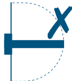
Single leaf, double acting