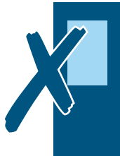
Aperturing to be completed by an approved third party BWF CERTIFIRE member only