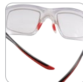
Bi-color & bi-material temples