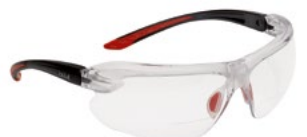
VERSIONS WITH READING AREA : +1.5 : IRIDPSI1,5 +2 : IRIDPSI2 +2.5 : IRIDPSI2,5 +3 : IRIDPSI3