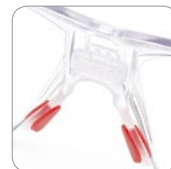
3 positions B FLEX nose