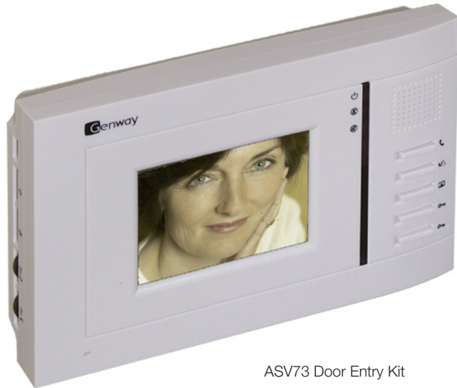
ASV73 Door Entry Kit