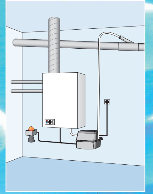
Pre-cabled connection for an alarm system