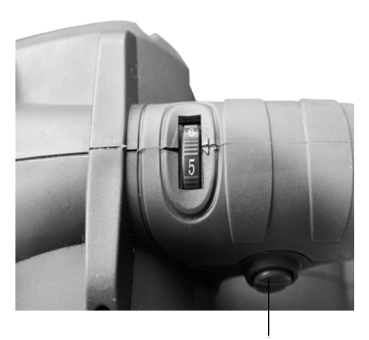
Fig.4 Locking button