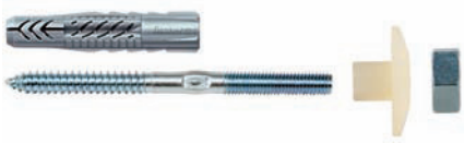
WST - Wash basin fixings