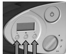
+ M - Fig 3